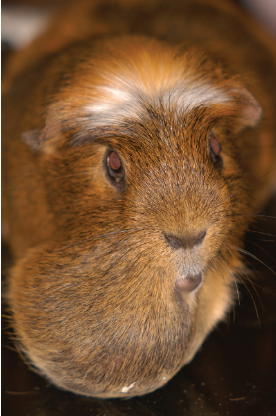
Figure 1.1 Abscess of the mandible as a result of chronic apical periodontitis of the first lower cheek tooth (P4) in a four-year-old guinea pig.

from quite advanced malocclusions or the formation of a tooth-associated jaw abscess which is clearly visible (Figure 1.1). Radiographs showing the extent of osseous changes that are already present are often met with amazement. How could the animals hide these painful conditions for such a long time?